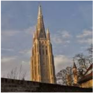
Church of Our Lady, Bruges

The Church of Our Lady in Bruges, Belgium, dates mainly from the 13th, 14th and 15th centuries. Its tower, at 122.3 meters in height, remains the tallest structure in the city and the second tallest brickwork tower in the world.