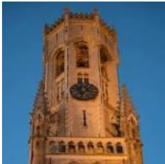
Belfry of Bruges

The Church of Our Lady in Bruges, Belgium, dates mainly from the 13th, 14th and 15th centuries. Its tower, at 122.3 meters in height, remains the tallest structure in the city and the second tallest brickwork tower in the world.